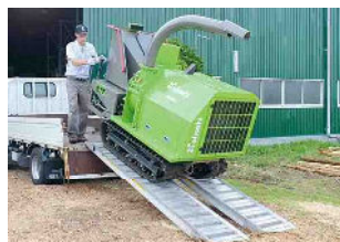
Easy to load on truck