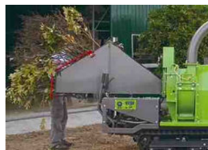
Leafy branches OK