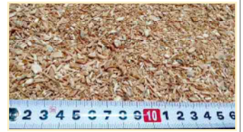
12 mm holed screen

Different chip sizes suit different purposes. Choose the hole size of the screen based on your needs.