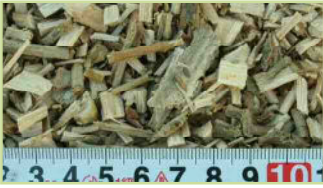
Wood (High Speed)