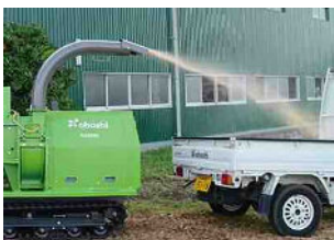
Discharge into truck