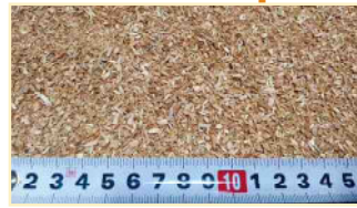
6 mm holed screen