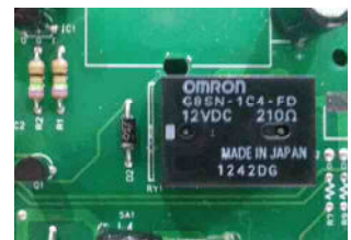
No Stress micro-computer