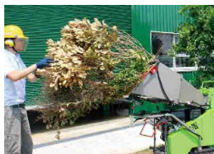
Leafy branches OK