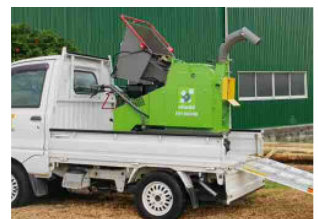
Able to load on a light truck or trailer