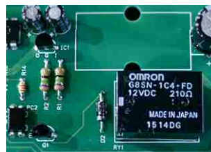
No stress micro-computer