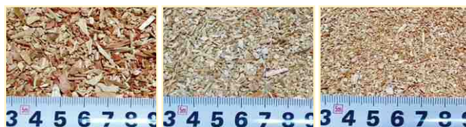
5mm holed screen

Different chip sizes suit different purposes. Choose the hole size of screen based on your needs.