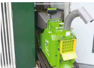
Only 72cm wide!