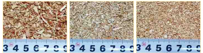
5mm holed screen

Different chip sizes suit different purposes. Choose the hole size of screen based on your needs.