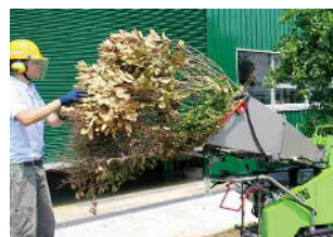
Leafy branches OK