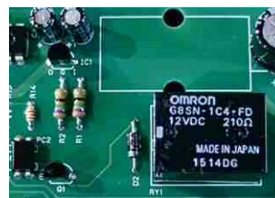
No stress micro-computer