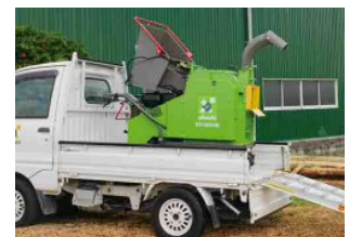
Able to load on a light truck or trailer