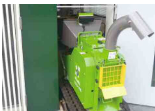
Only 73cm wide!